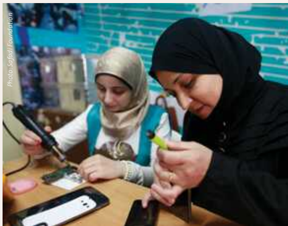
Women participating in a course on mobile repairing, at the Social Development Center of Tarik El Jdide.

Extreme violence and discrimination have driven over 727,000 Rohingya refugees across the border into Cox's Bazar, Bangladesh. Thousands of Rohingya women and girls are vulnerable to the health and security risks of crowded camp settings. At night, women find it difficult to visit camp latrines due to