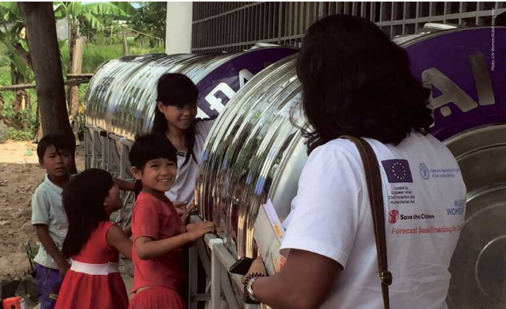
Distribution of water tank as one of early action identified by women and men in Gia Lai province before the drought season.

To leverage expertise and strengthen buy-in and reach for gender-responsive DRR and resilience, UN Women partnered with 16 UN agencies including UNICEF, UNDRR, UNDP, FAO and UNFPA, 56 CSOs and NGOs including women's organisations, 2 private sector companies, 3 academic entities, and 20 other entities such as national level line ministries, totaling altogether 97 partners in 31 operational country contexts.