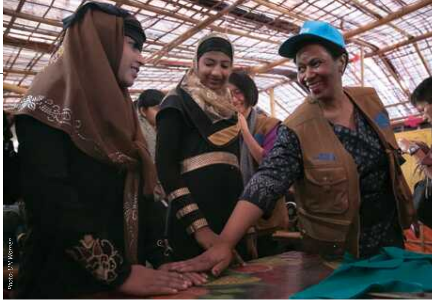
UN Women's Executive Director visits Multi-Purpose Centre in Rohingya Camp, Cox Bazaar, Bangladesh.

UN Women exists to promote and enable. In spaces such as the Grand Bargain we helped bring humanitarian actors together to strengthen standards, guidance and norms. In spaces like the Interagency Standing Committee and in crises on the ground we led and co-led gender coordination efforts, like the IASC's Accountability Framework for its Gender Policy. On the ground hundreds of thousands of women and girls accessed our services, delivered in collaboration