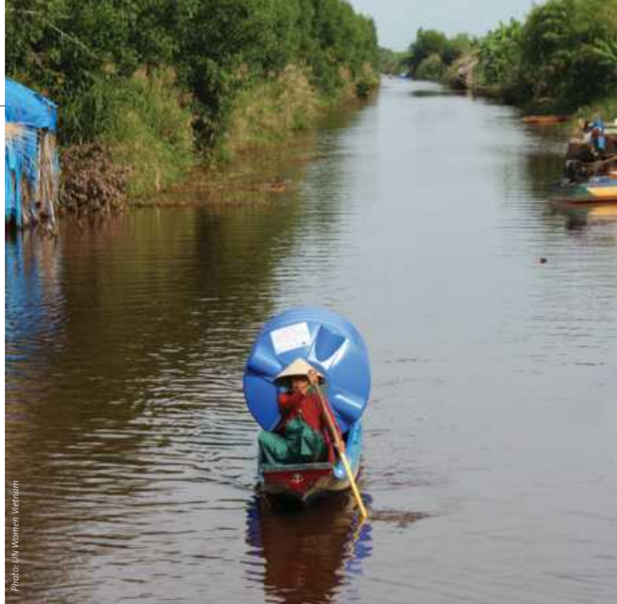
Delivery of water tank for drought preparedness programme in Vietnam.

In 2018 UN Women continued or initiated joint programmes with UNDP, WFP, OCHA, UNFPA, IOM, UNHCR, UNICEF, UNODC, FAO, UN Habitat, and UN peacekeeping operations in 20 countries. These programmes covered economic empowerment, livelihoods, agriculture and food security, including LEAP; addressing child marriage; youth; preventing and countering trafficking, transporter crimes and terrorism through empowerment; preventing and addressing GBV and violence against women; access to justice for refugee and host communities; sexual and reproductive health services; demobilization, disarmament and reintegration (DDR) and other programming to transform gender norms and promote equality. UN Women also engaged in CERF activities with other partners. UN Women also engaged in joint DRR programming with UNDRR and IFRC.